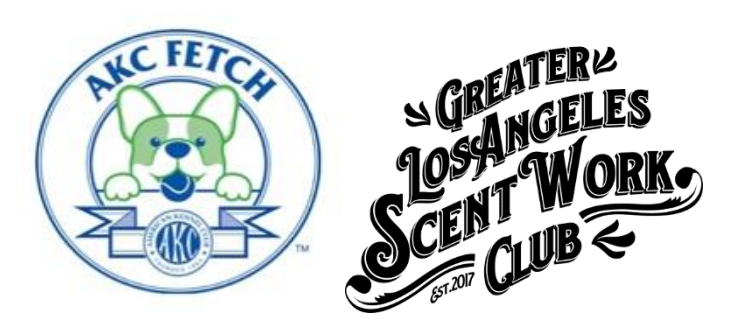
Licensed by the AKC AKC All-Breed FETCH TRIAL This Event is Accepting Entries for Dogs Listed in the AKC Canine Partners Program

DAY OF EVENT ENTRIES will be permitted at this Fetch testing. **ALL TIMES IN THIS PREMIUM LIST REFER TO PACIFIC TIME.